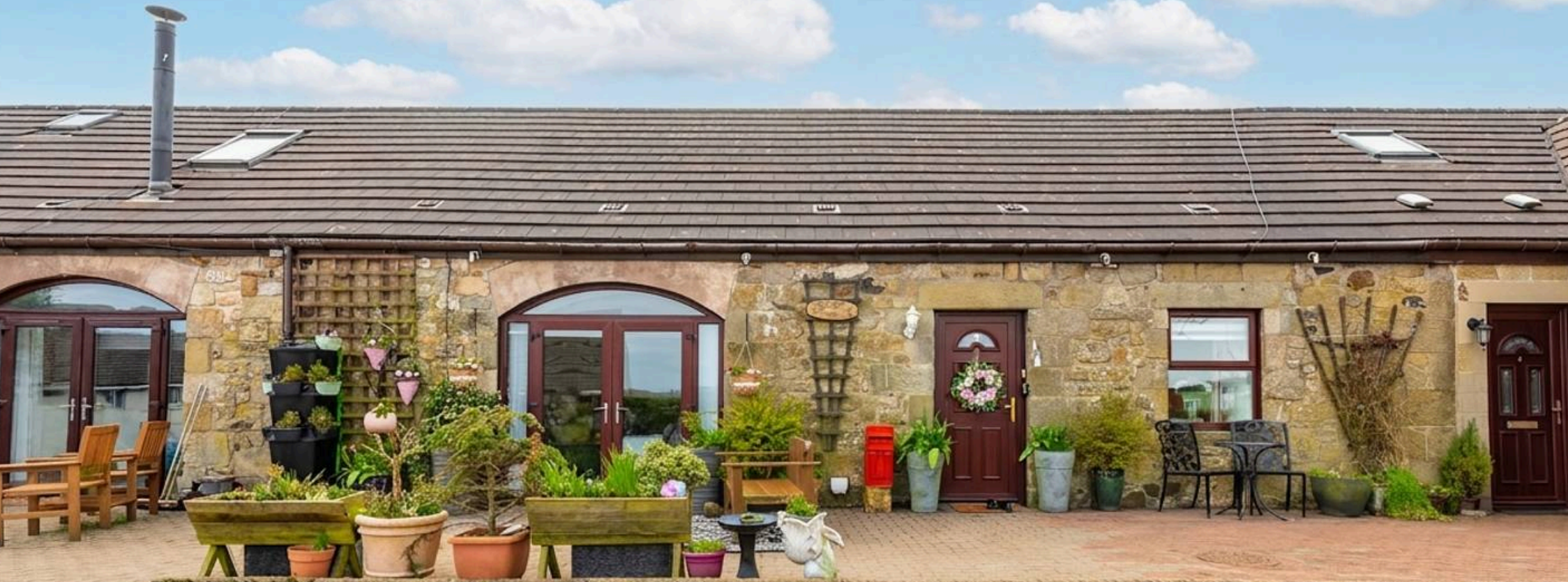
Snowdrop Cottage, 3 Tarrareoch, Armadale